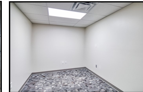
Unit 4 Office