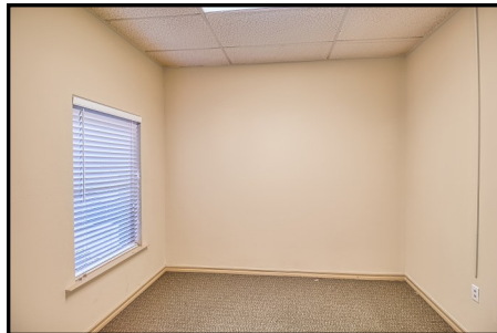
Unit 2 Office