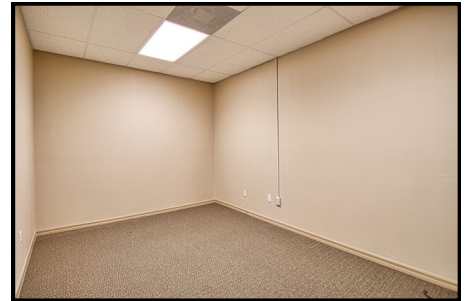
Unit 2 Conference Room