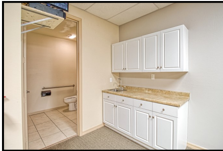
Unit 2 Kitchenette and Restroom