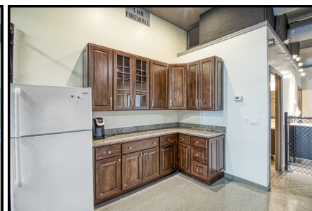
Unit 4 Kitchenette