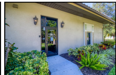
Unit 4 Entrance