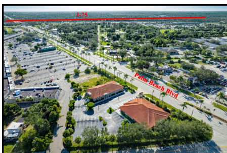
Aerial - Location to I75