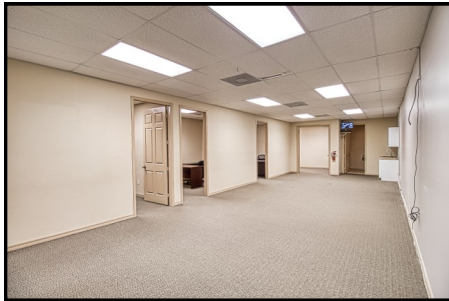
Unit 2 Open Workspace