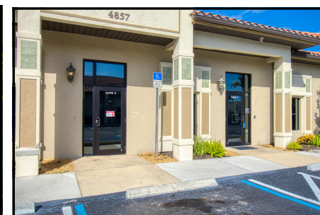
Entrance Unit 2 & 3

VIP Realty Group, Inc. - Commercial | 13131 University Drive | Fort Myers | Florida | 33907 Phone 239.489.3303