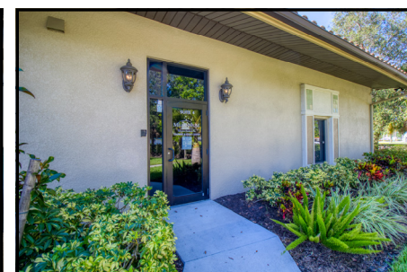
Unit 4 Entrance