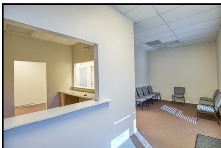
Unit 3 Reception Area