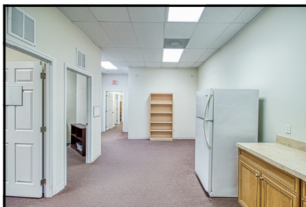
Unit 3 Breakroom