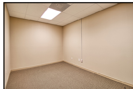
Unit 2 Conference Room