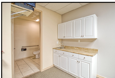
Unit 2 Kitchenette and Restroom