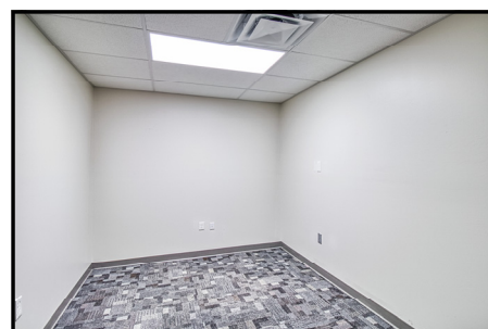
Unit 4 Office