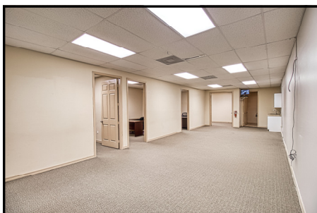
Unit 2 Open Workspace