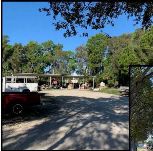
Fenced Yard & Aluminum Carport