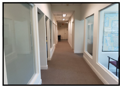
Office Area Hallway