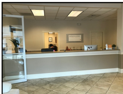
Second Entrance Reception Area