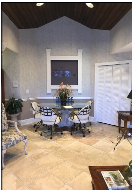
Main Entrance / Reception/Showroom Area