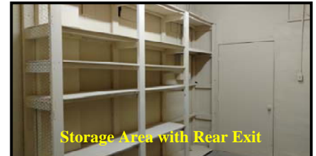
Storage Area with Rear Exit