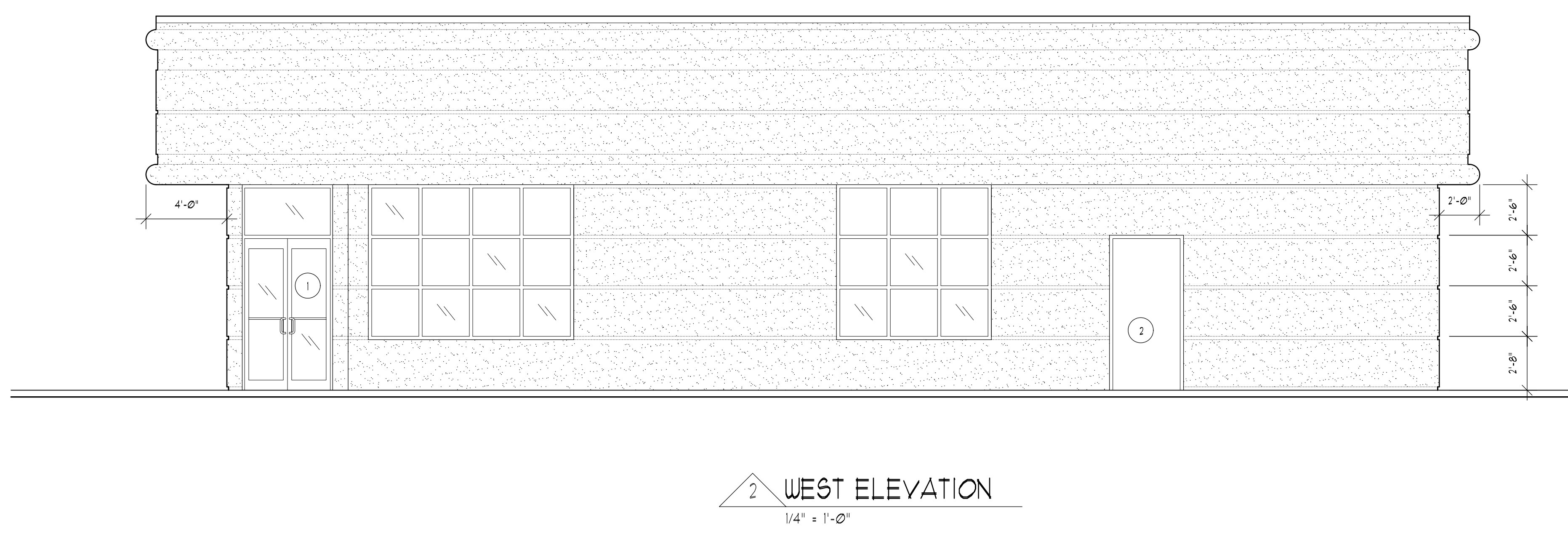
2 WEST ELEVATION 1/4" = 1'-0"