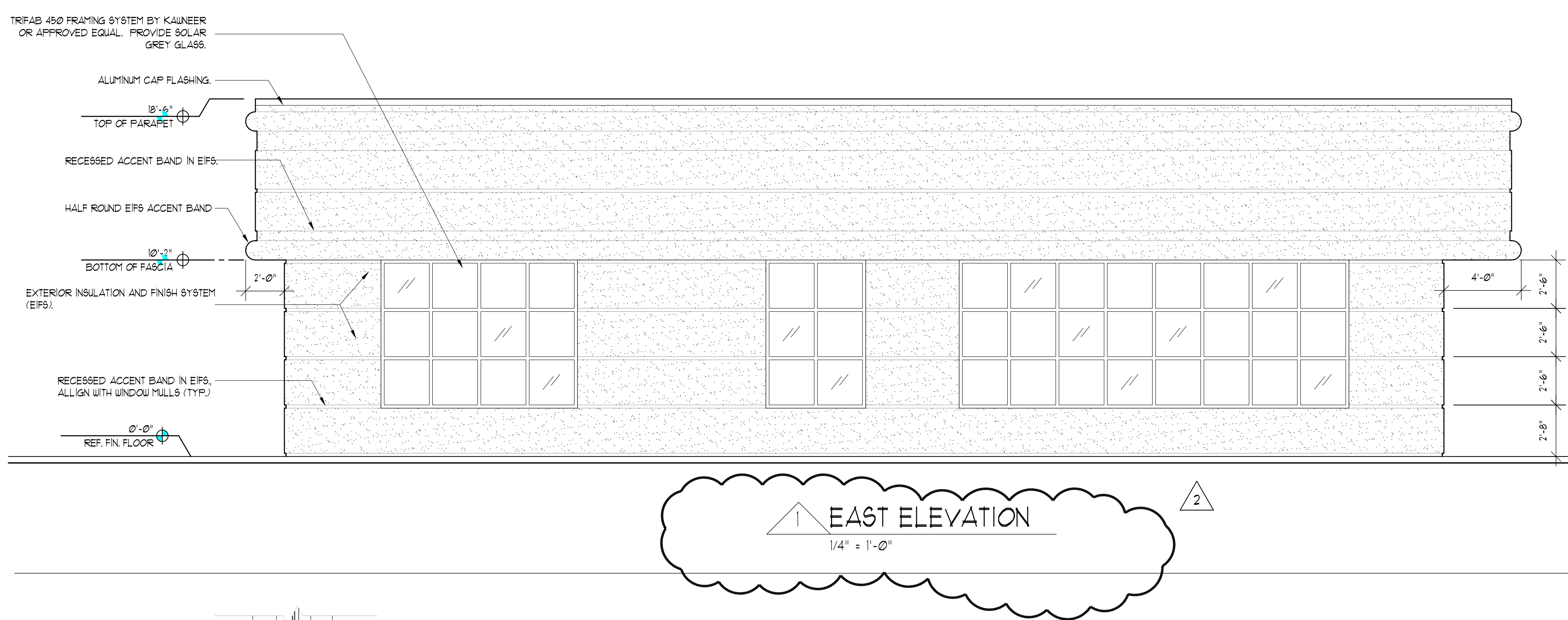
1 EAST ELEVATION 1/4" = 1'-0"